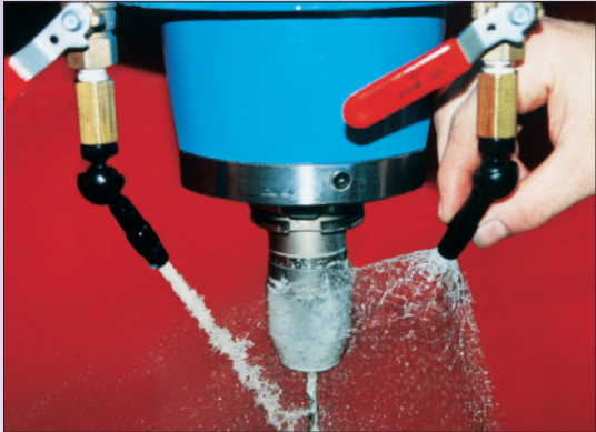
MillJets shown in use at various angles and spray widths.