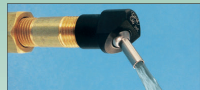
CapJet shown installed on end of threaded pipe.

Material: Body: Acetal Ball & Extension: Stainless Steel Maximum Pressure: 150 PSI (10 bar) Maximum Operating Temperature: 160°F (70°C)